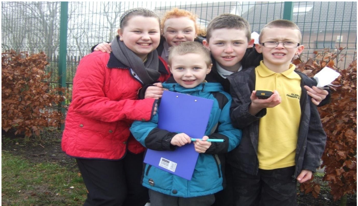
Primary Six and Primary Two work together on geo caching