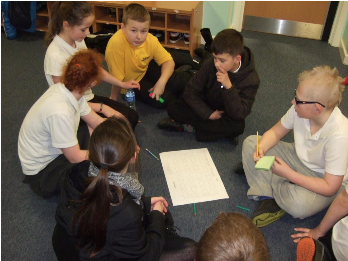
Pupils from Glenlee and St. Blane’s Primary working together their shared learning.

Primary Seven have undertaken thought provoking joint learning with their peers at St. Blane’s Primary School. This has been on the theme of anti-sectarianism. The children have used the book “Divided City2 as a stimulus for discussion and learning across the curriculum. The project has involved the children the pupils in working together to develop a joint understanding of ant-sectarianism. Pupils work will be on display at the Scottish Parliament. This year work of a similar nature will be undertaken with St Cuthberts Primary.