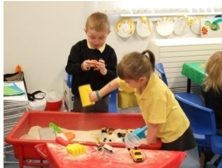
Active Learning in Primary One

Glenlee Primary has been seen as a model of good practice in the Early Stages and this was recognised at a national conference in January 2013 where staff were invited to give a presentation to the delegates.