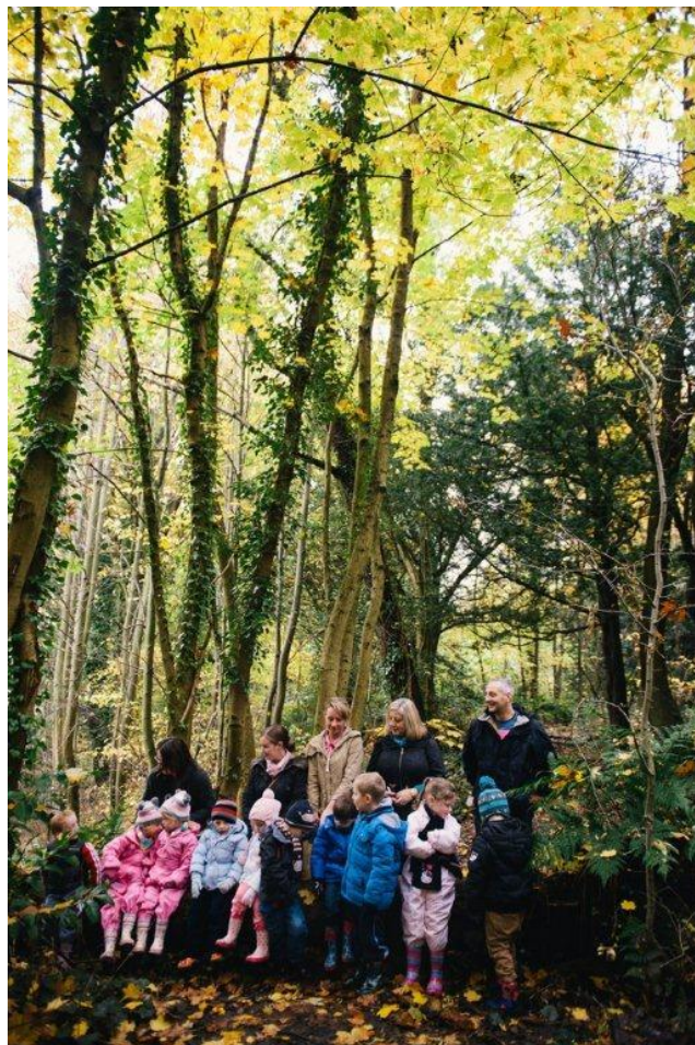
Children, parents and staff visit Glenlee and Udston Woods.